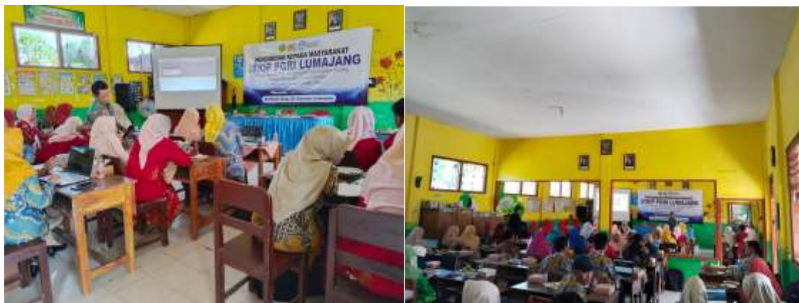
Figure 3. Implementation of Training and Mentoring

The focus of the community service is to provide socialization, training, and mentoring to class teachers at SD, MI, MTs and MA in Bago and Condro Villages, Pasirian District, Lumajang Regency in creating online student learning spaces based on technology. This activity was carried out at SD Negeri Bago 3 for 2 days on Sunday-Monday, September 22-23, 2024. On the first day, training activities were carried out and mentoring activities were carried out on the second day. However, considering the enthusiasm of the participants in participating in the PKM activities, the activities on the second day were carried out on the first day after the mentoring activities ended. This activity was attended by various schools in Bago Village and Condro Village, Pasirian District, Lumajang Regency. The number of participants who took part in this PKM activity was 57 people. The majority of teachers were very enthusiastic about asking questions about how to write or create a programming language that can be used directly for the Powerpoint application, and asking what the solution is if there is a programming language that experiences an error or does not work. A snippet of the enthusiasm of the participants while actively participating in the training activities can be seen in Figure 3.